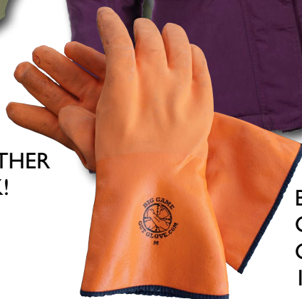
BIG GAME GUT GLOVES 12-INCH!