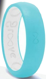
GROOVE LIFE THIN SILICONE RING!