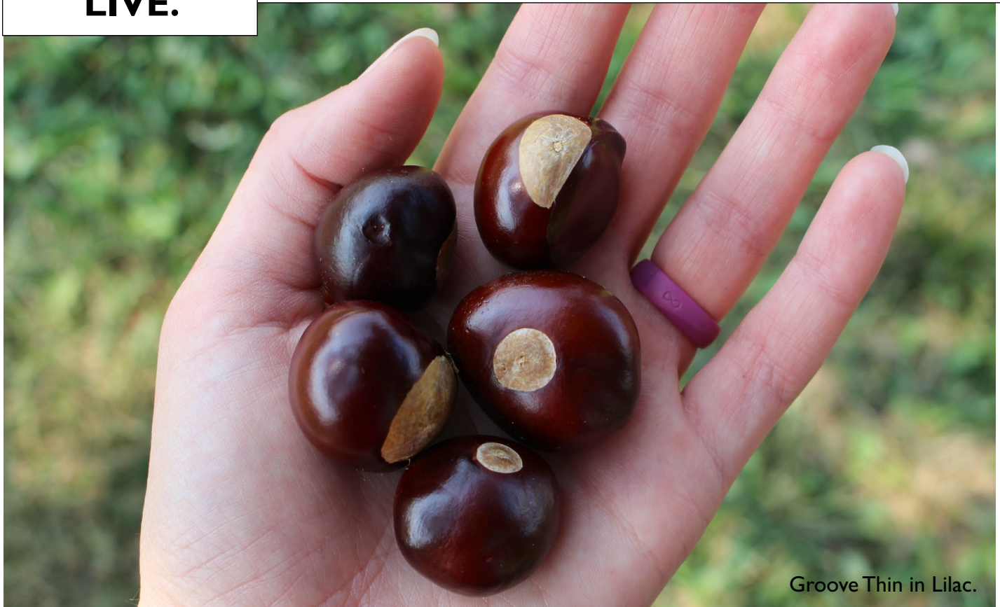
Groove Thin in Lilac.

doesn't end up moving or closing, which ours just did - making the coverage even harder to withhold.