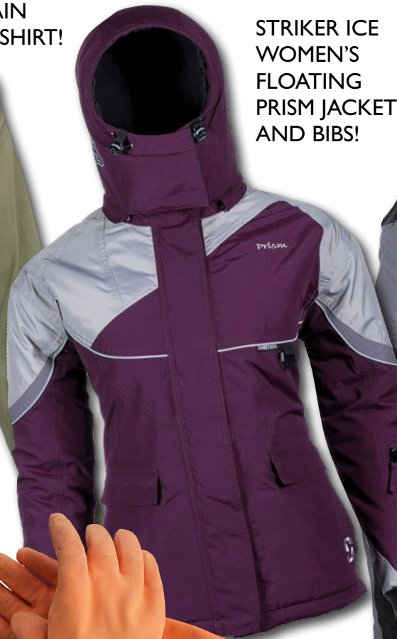
STRIKER ICE WOMEN'S FLOATING PRISM JACKET AND BIBS!