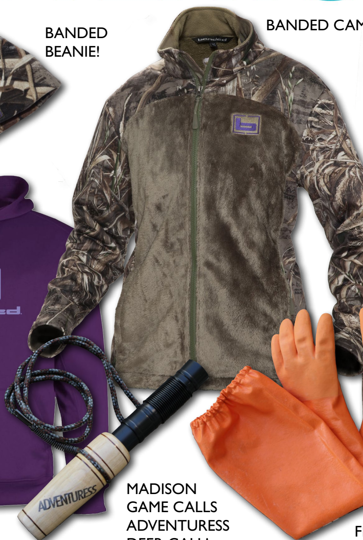
BANDED CAMO JACKET AND PANTS!