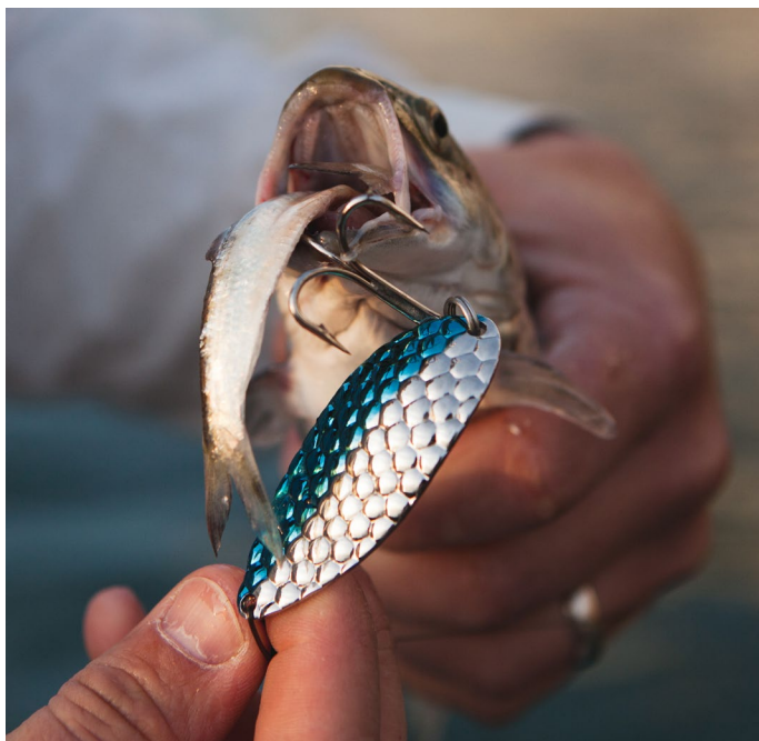
A flashing silver spoon, like an Acme Little Cleo, in the current can trigger an instinctual bite.