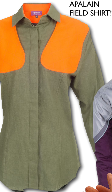
APALAIN FIELD SHIRT!