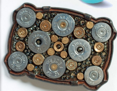
PRETTY HUNTER $250 SHOPPING SPREE!

these categories! LABEL your high-res/original photos with your name and each category (firstlastname_Hunt.jpeg) and EMAIL them to inspire@bettheadventuress.com with your LOCATION and a LINK to your social media. You must have a photo for all four categories to be entered, and you must clearly be in each photo. DO NOT send small, low-res social media copies of photos. DEADLINE: Wednesday, December 27th. Other winners chosen as well! Make sure you follow ADVENTURESS social media and watch for more information!