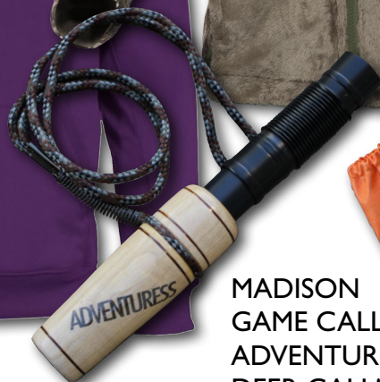
MADISON GAME CALLS ADVENTURESS DEER CALL!