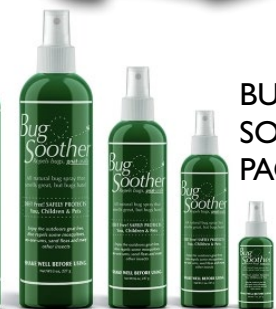
BUG SOOTHER PACK!