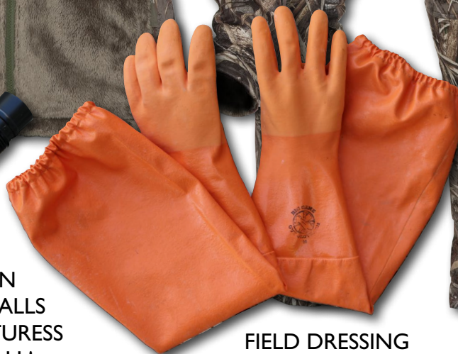
FIELD DRESSING BIG GAME GUT GLOVES!